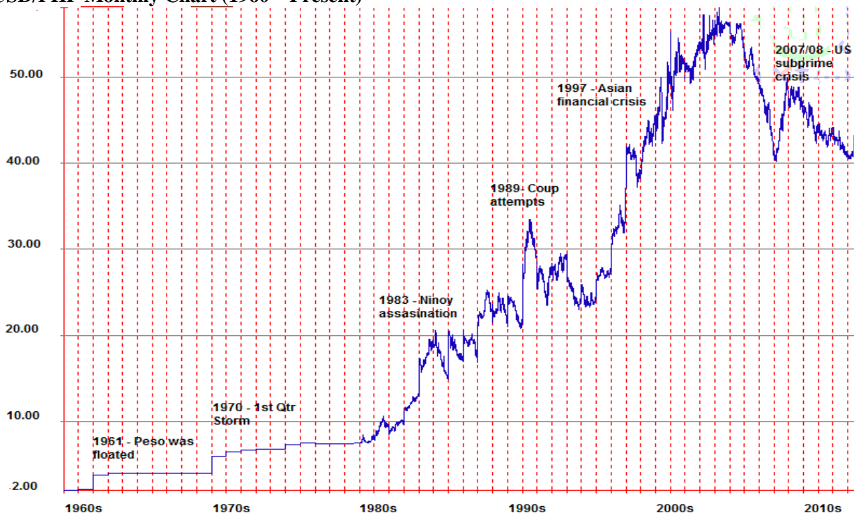
USD/PHP Monthly Chart (1960 – Present)